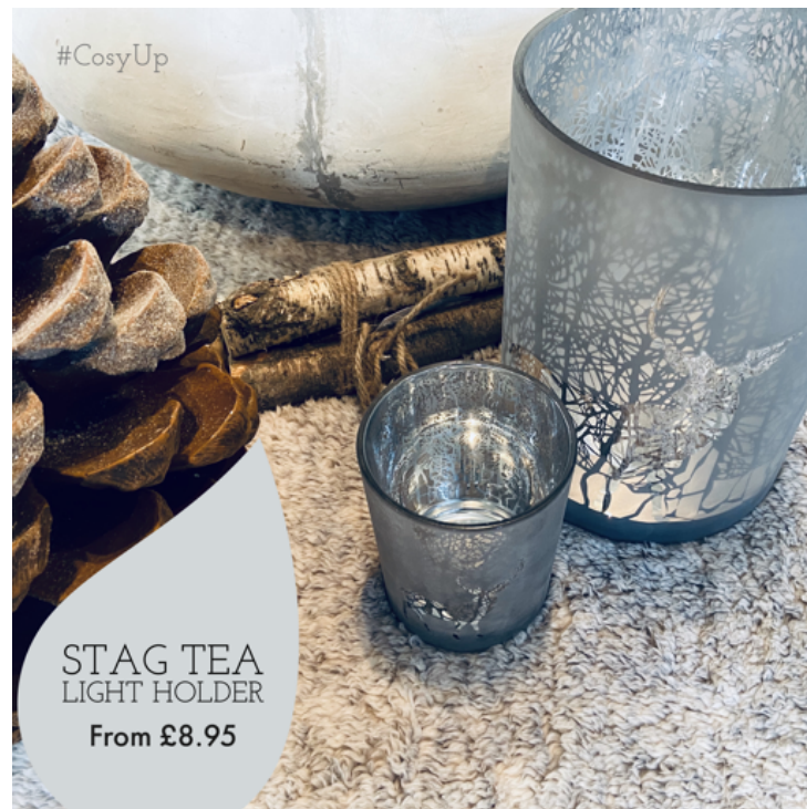
STAG TEA LIGHT HOLDER From £8.95