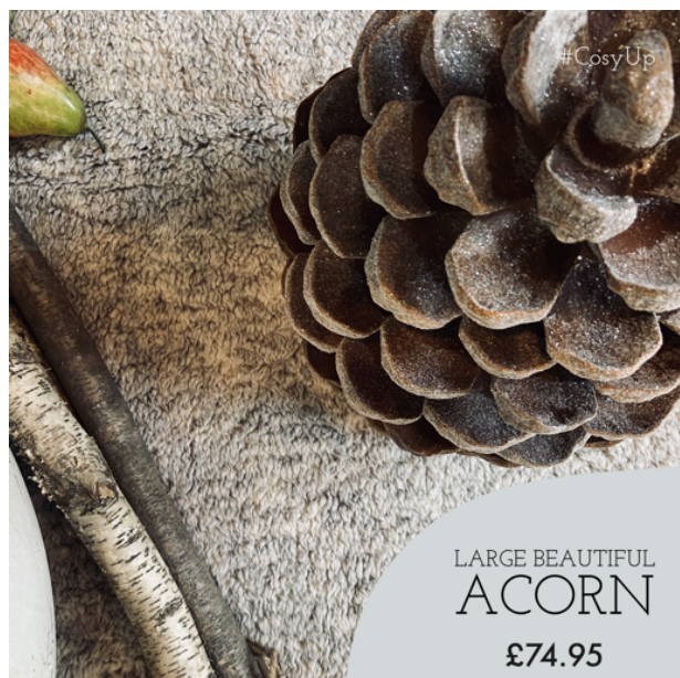
LARGE BEAUTIFUL ACORN £74.95