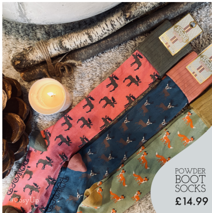
POWDER BOOT SOCKS £14.99