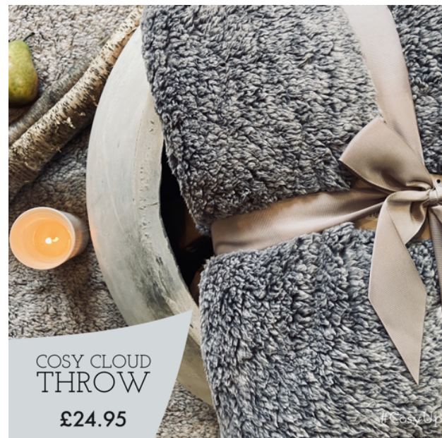
COSY CLOUD THROW £24.95

We have so much to see in-store, Pop 'in soon.