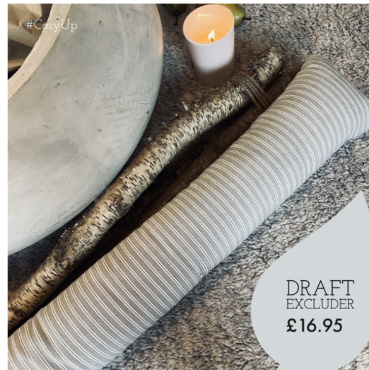
DRAFT EXCLUDER £16.95